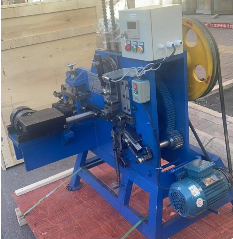
PET strapping seal machine